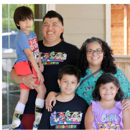
Thank You to Our County, City, and Community Partners For Joining Us at Our 500th Home